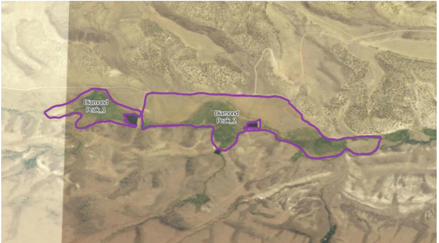
Figure 1 – Map of Project Fields