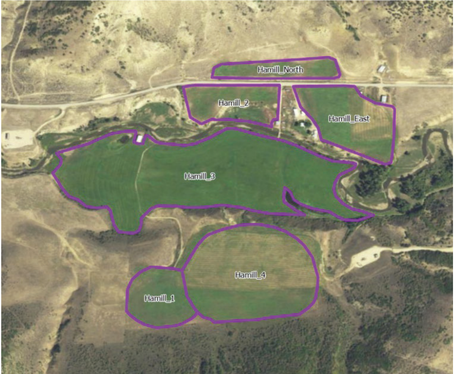
Figure 1 – Map of Project Fields