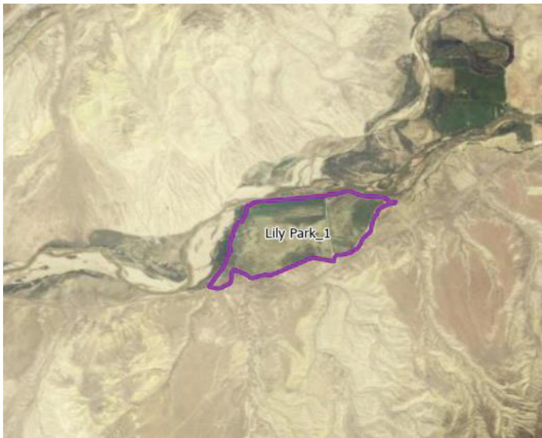
Figure 1 – Map of Project Fields