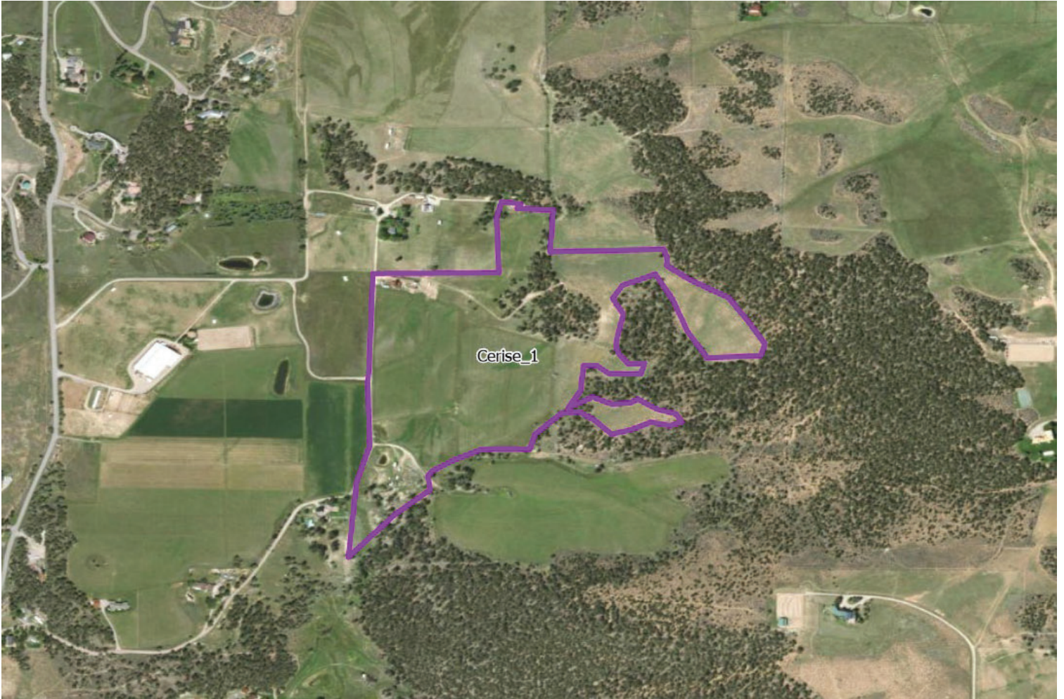
Figure 1 – Map of Project Fields