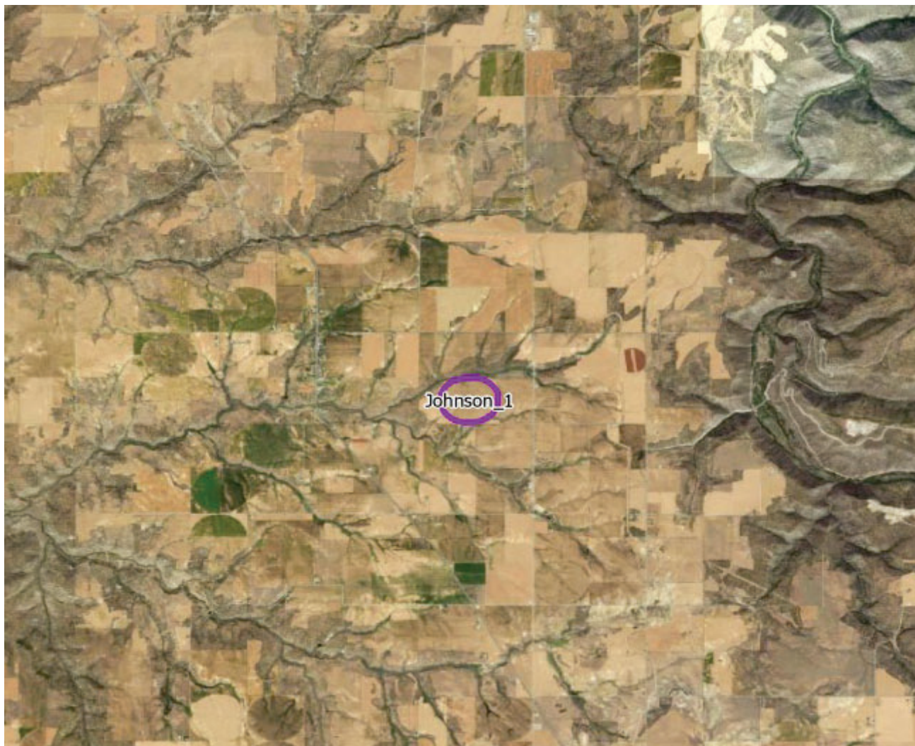
Figure 1 – Map of Project Fields