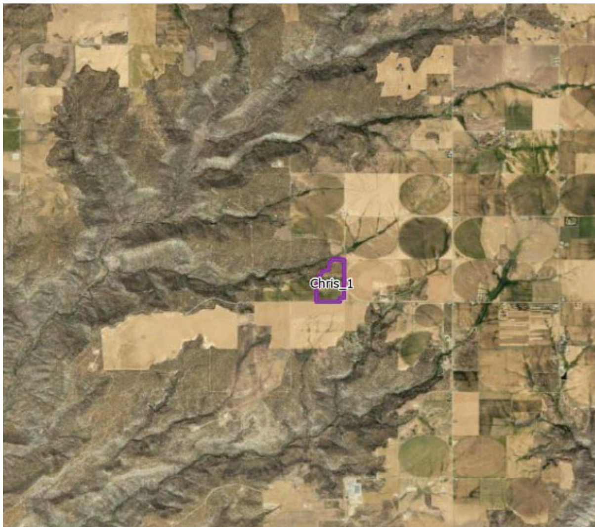
Figure 1 – Map of Project Fields