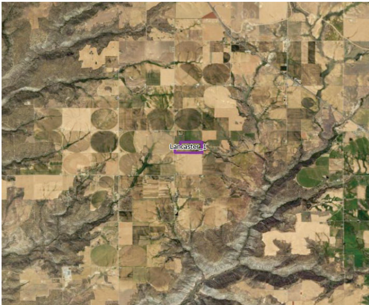
Figure 1 – Map of Project Fields