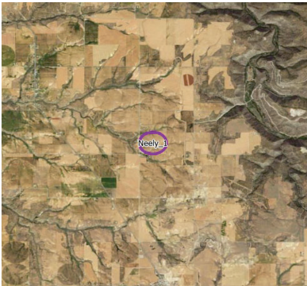
Figure 1 – Map of Project Fields