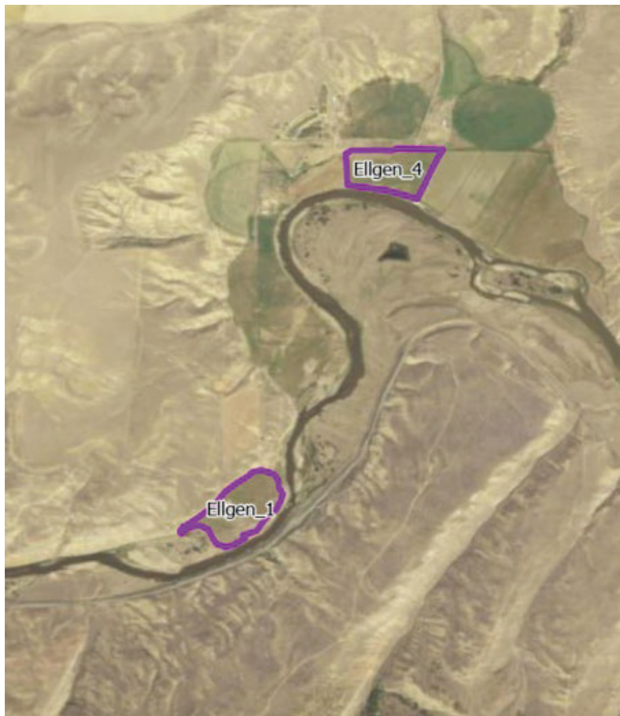
Figure 1 – Map of Project Fields 1