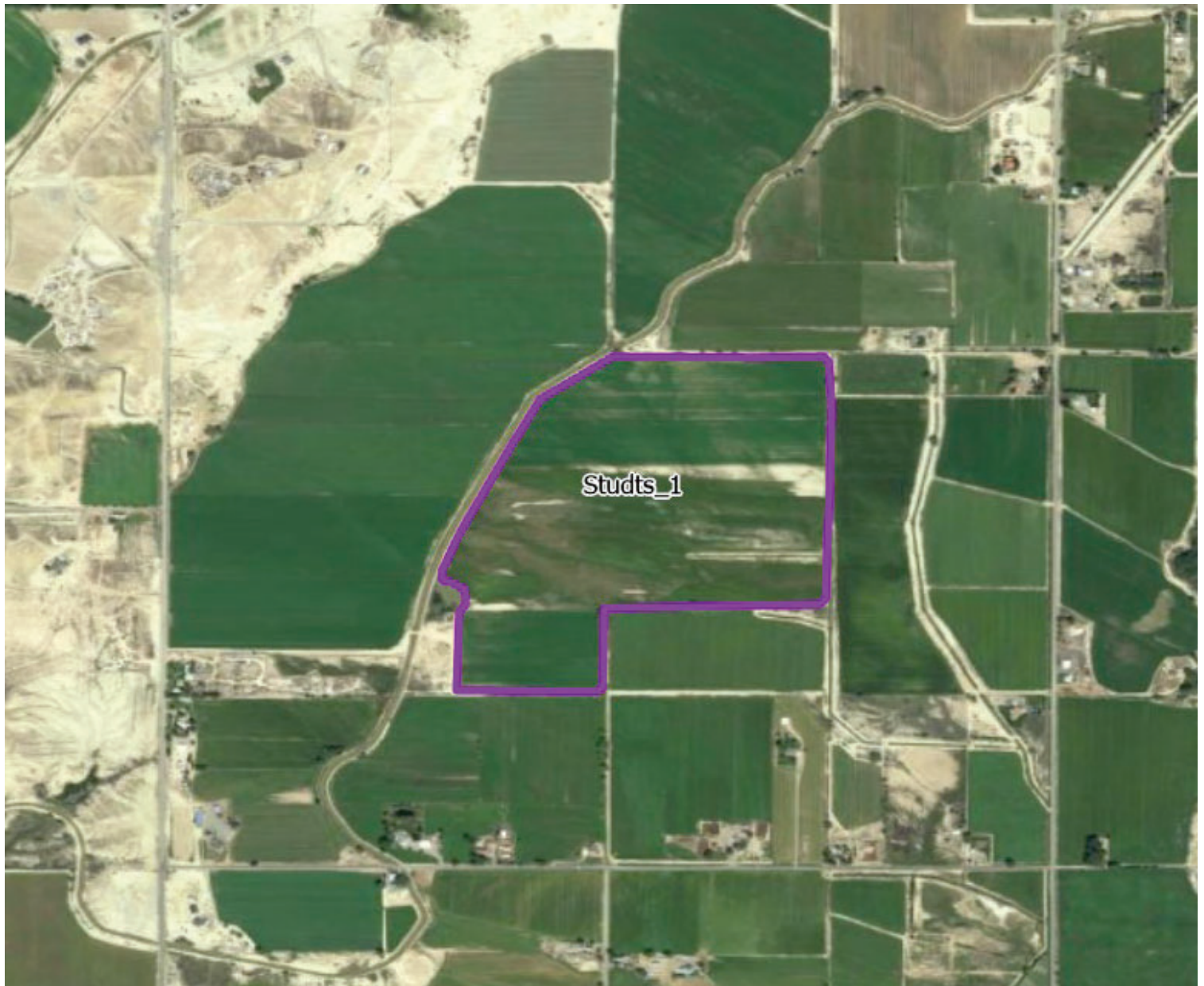
Figure 1 – Map of Project Fields 1