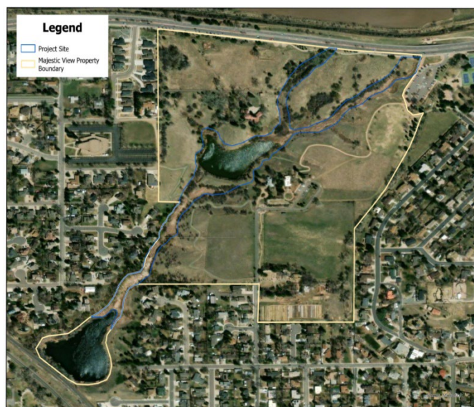
Figure 1. Project area and NWR boundaries. Note the communities immediately adjacent to this valuable refuge.

The Majestic View Nature Center (MVNC) is a wetland conservation and restoration agency in Arvada with a focus on recreation and environmental education with two lakes, Oberon and Hayes, connected by wetlands and riparian habitat. These areas provide vital refuge for wetland-dependent wildlife but face threats from sedimentation, reduced water availability, and invasive species. These challenges impact ecological integrity and the diversity of wetland plant communities preferred by waterfowl, migratory birds, and resident wildlife. The need for this project was identified in the MVNC's 2022 Annual Report and MVNC's 2022 Strategic Recommendations.