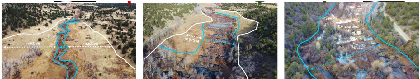
Figure 1. Potential improvements along Fourmile Creek's floodplain as a result of this project.

This applicant has previously received a Water Plan Grant which supported the Envision Recreation in Balance Sediment Control Grant, and supported the groundwork of this project application. Further, the goals of this project are directly aligned with numerous components and action items associated with the Thriving Watersheds, Vibrant Communities and Resilient Planning focus area in the 2023 Water Plan, and is also integrated with the 2020 Chaffee County Community Wildfire Protection Plan, the Rocky Mountain Restoration Initiative Upper Ark Thrives Project and the 2021 Chaffee County Outdoor Recreation Management Plan.