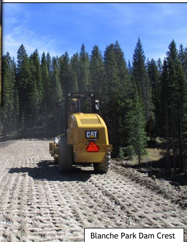
Blanche Park Dam Crest