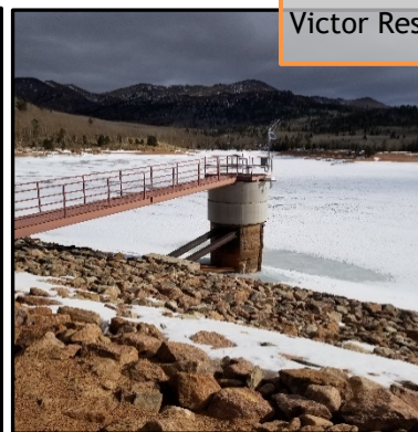
Victor Reservoir No. 2