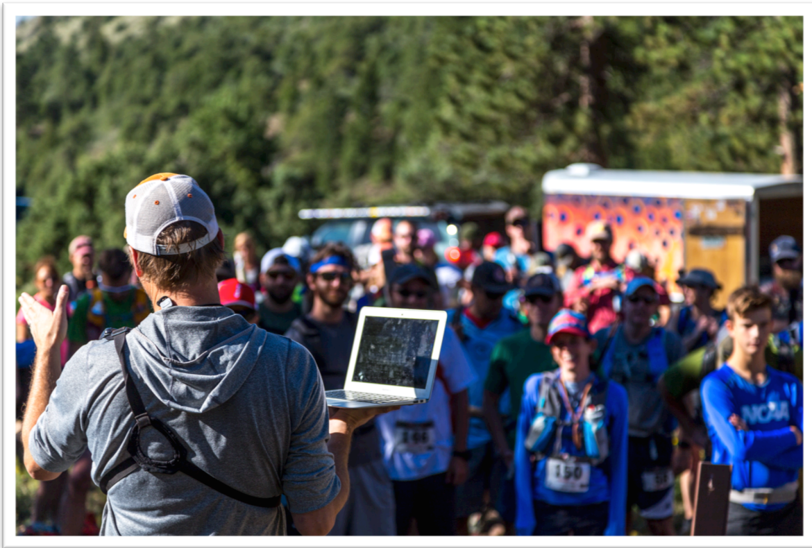
Trout Force One at the start line of the 2017 Middle Creek Flyathlon