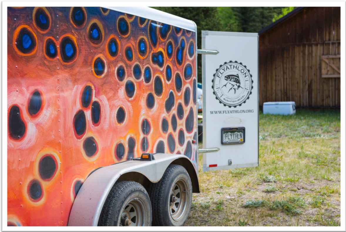
Trout Force One, in all her glory, at the start of the Miners Creek Flyathlon