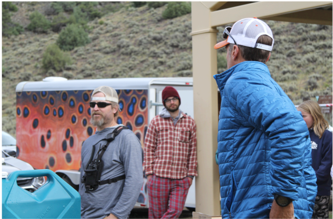
Trout Force One at the start of the 2017 Lake Fork Flyathlon, held near Gunnison, CO