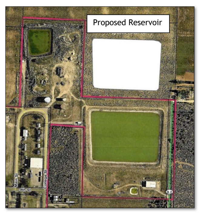
Water Plan Grant - Data Sheet

Funding Recommendation: Staff is recommending a conditional approval of the full request in the amount of $800,000 for up to 50% of project costs from the Water Storage and Supply category. Approval is conditioned upon the Town submitting a CWCB loan application for the remaining costs of the project by the February 2022 loan application deadline. This project aligns with the Water Plan's measurable goal of creating 400,000 AF of water storage by 2050 by providing new storage in the Southwest basin.