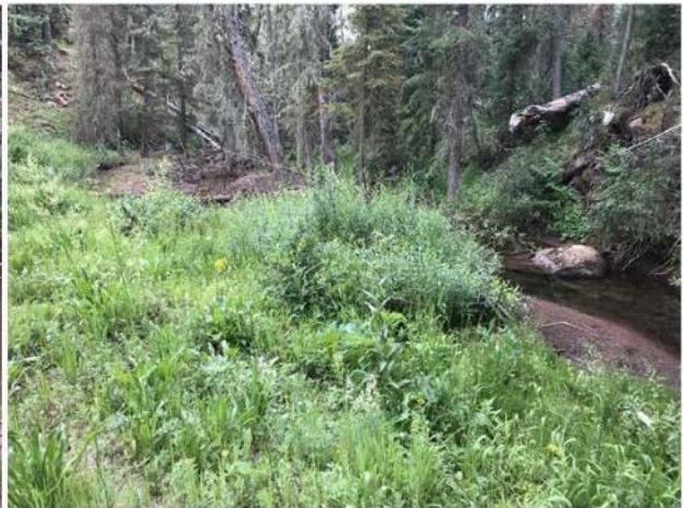
July 21, 2020 – 2-years after fire