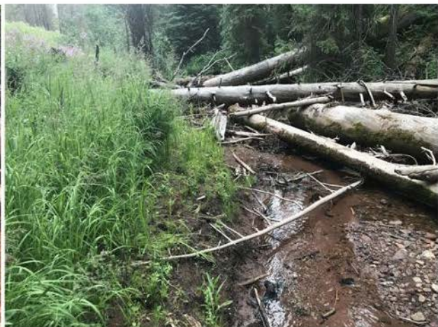
July 21, 2020 – 2-years after fire