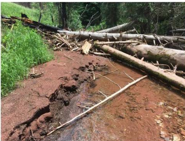
July 16, 2019 – 1-year after fire