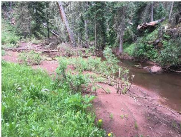
July 16, 2019 – 1-year after fire