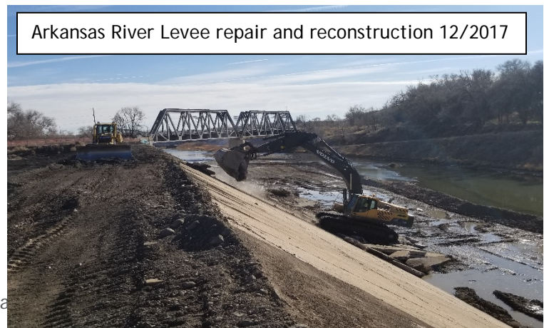
Arkansas River Levee repair and reconstruction 12/2017