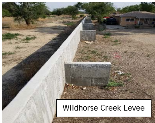
Wildhorse Creek Levee