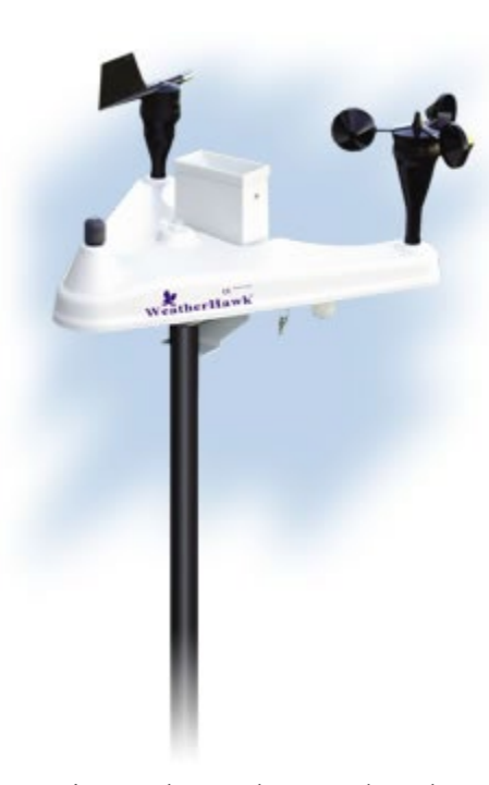
Figure 2: Weather Stations to be Implemented on the Demonstration Plots