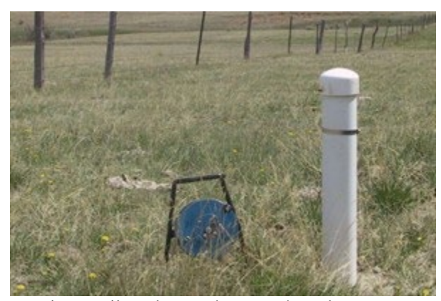
Figure 4: Artesian Wells to be Implemented on the Demonstration Plots