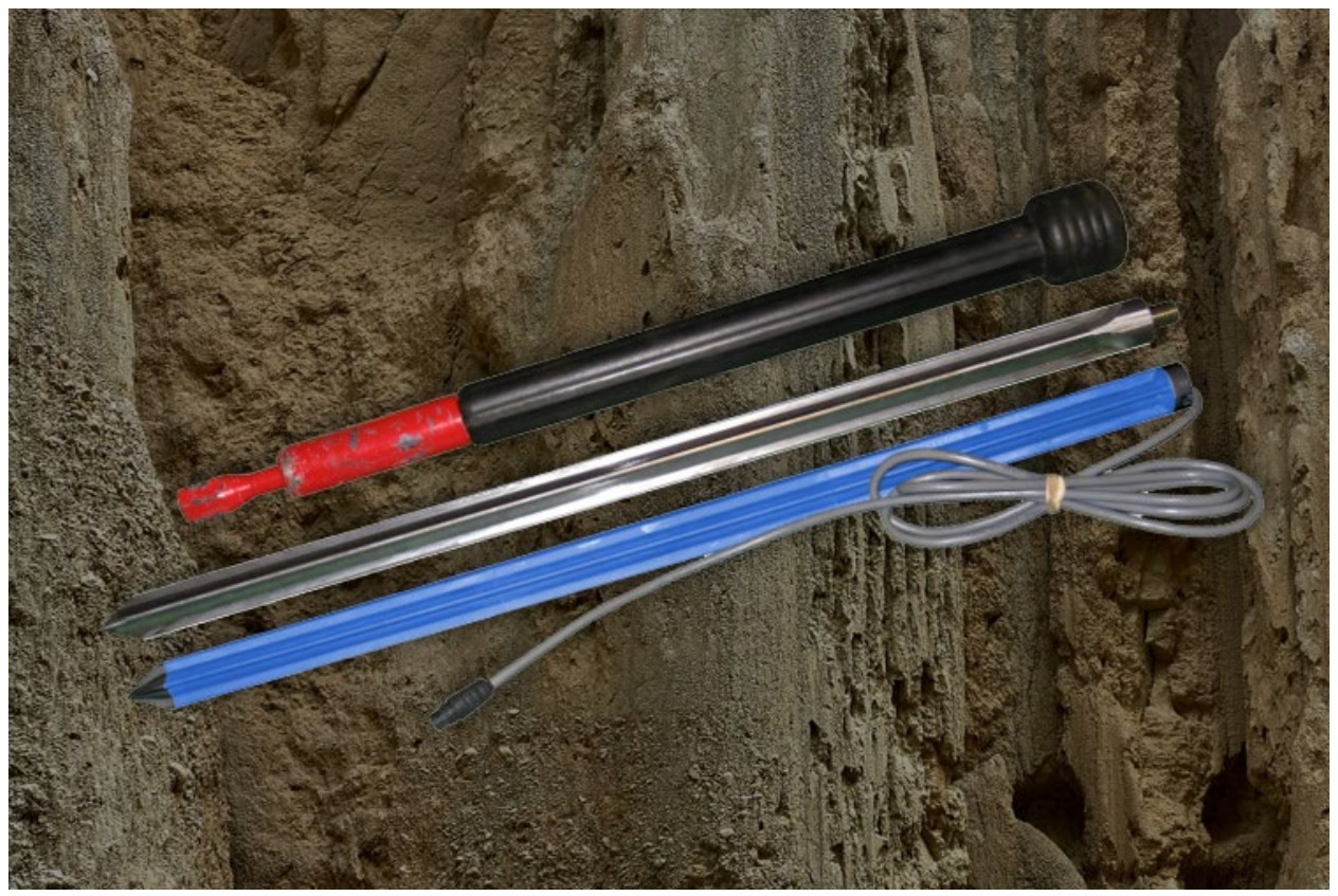
Figure 3: Soil Moisture Probes to be Implemented on the Demonstration Plots