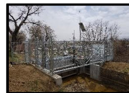
Project photos of Leyden Flushing Structure