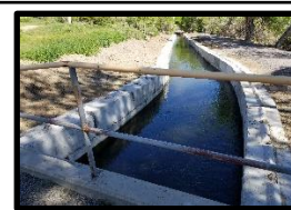
Project photos of Area 15 Lining