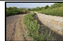
Project photos of Headgate 53 Retaining Wall