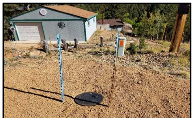
Project photos of Arabian Acres automatic meter installation and connection to distribution system.