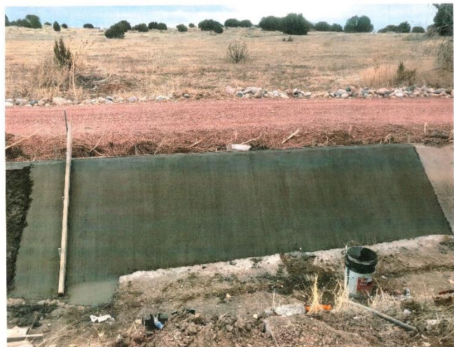
Completed 8 foot Section of Canal Lining