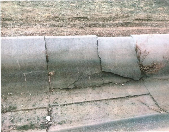
Typical Pre-existing Upper Canal Liner Condition.