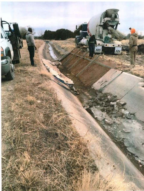
Forming and Delivery of Concrete.