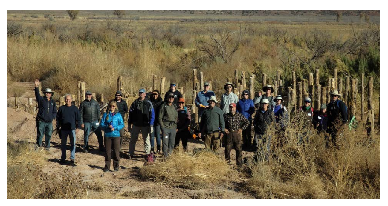
Figure 1: WRV Volunteers in Paradox valley during the 2019 DRRP volunteer event

Figure 2: WRV Volunteers caging cottonwoods during the 2019 DRRP event along the Dolores River