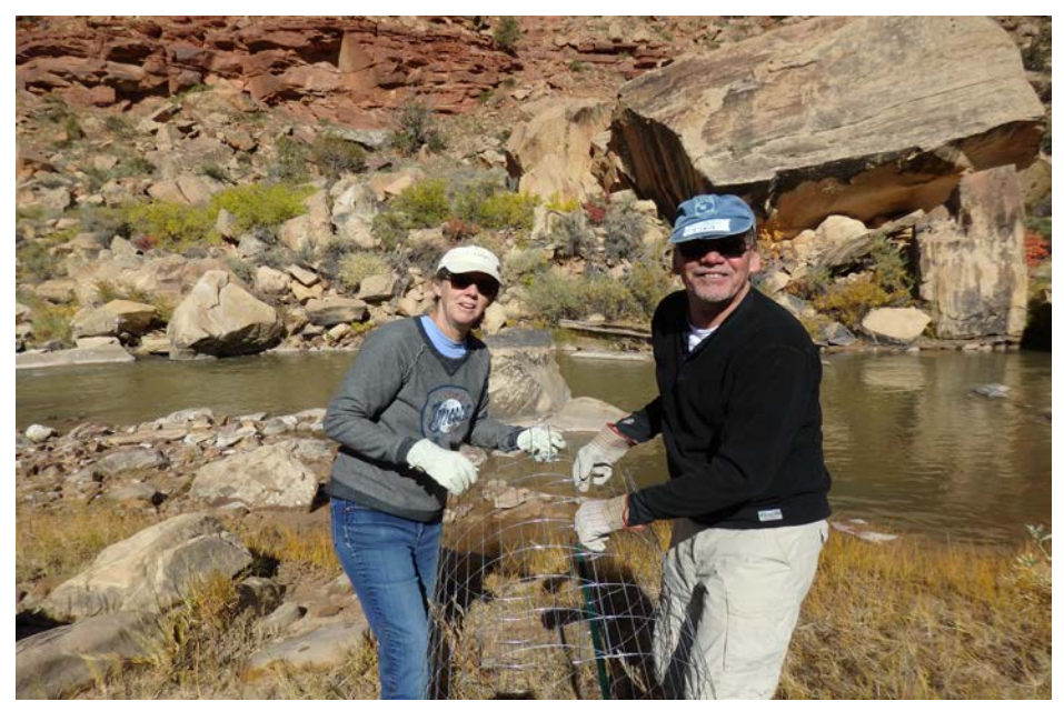
Figure 2: WRV Volunteers caging cottonwoods during the 2019 DRRP event along the Dolores River