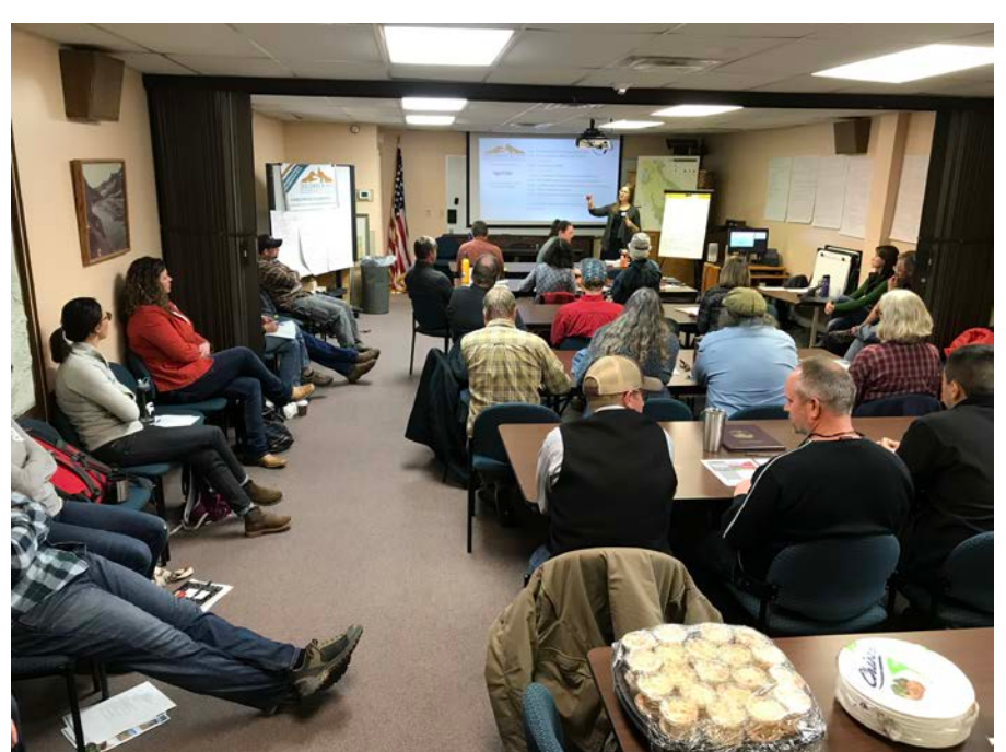
Figure 4: 2019 DRRP Annual Partnership Meeting in Moab, Utah

Figure 3: WRV Volunteers and conservation corps members planting cottonwoods in Big Gypsum Valley in 2018