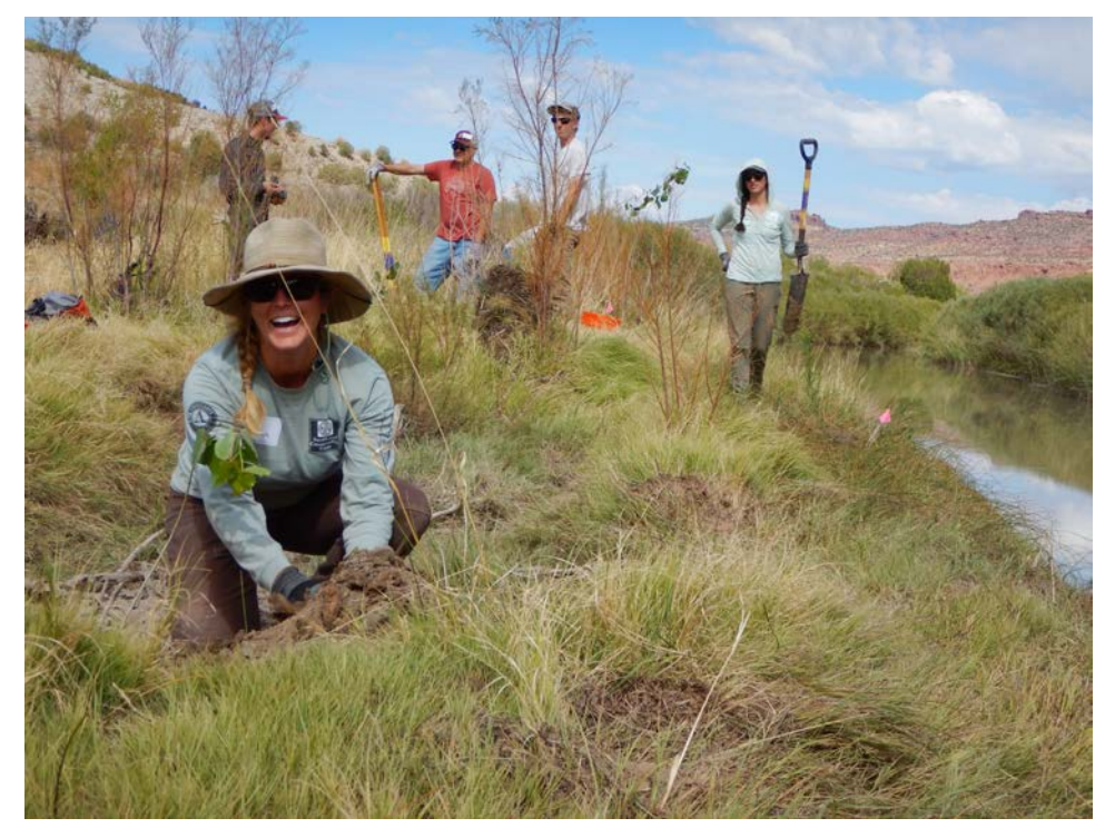
Figure 3: WRV Volunteers and conservation corps members planting cottonwoods in Big Gypsum Valley in 2018