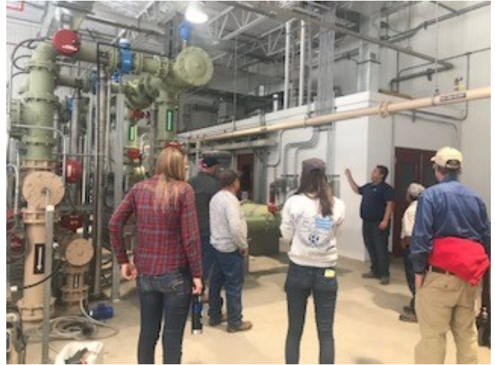
Denver M&I Water Tour