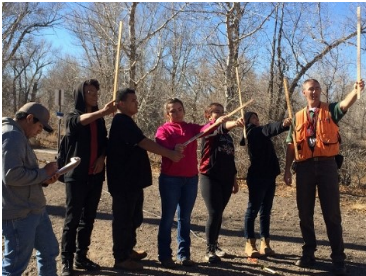
Envirothon Participants working on Forestry Skills.