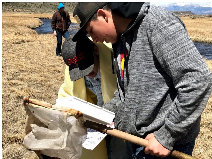
Envirothon Students participate in an aquatics study.