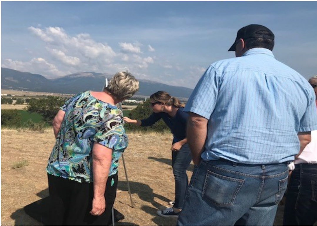
PEPO Upper Arkansas PEPO Team explain the alluvial storage project.