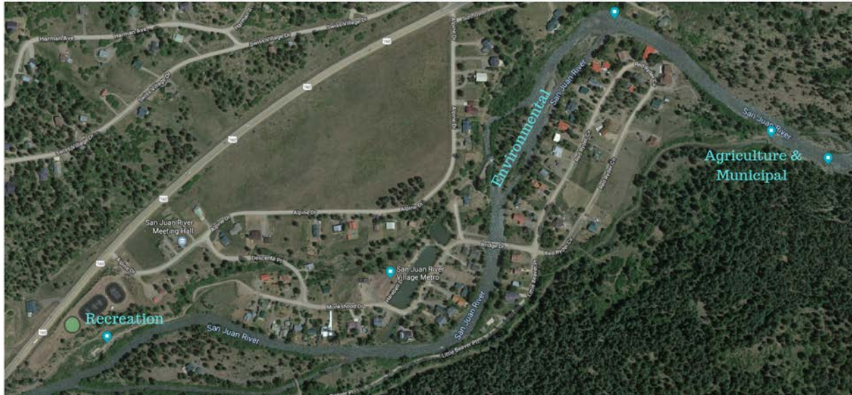
Figure 1: Proposed project area of Concept Design Plan.

The map below illustrates the potential scope of the proposed Concept Design Plan project site. However, final project locations will be determined by property owners, public stakeholders, and the Upper San Juan Watershed Enhancement Partnership.