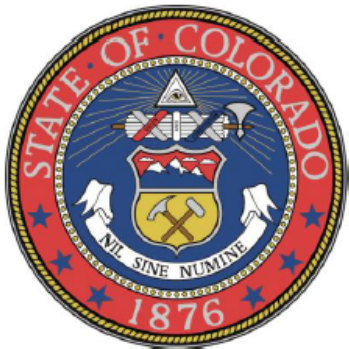
Secretary of State of the State of Colorado

I have affixed hereto the Great Seal of the State of Colorado and duly generated, executed, and issued this official certificate at Denver, Colorado on 07/03/2019 @ 14:25:34 in accordance with applicable law. This certificate is assigned Confirmation Number 11666891 .