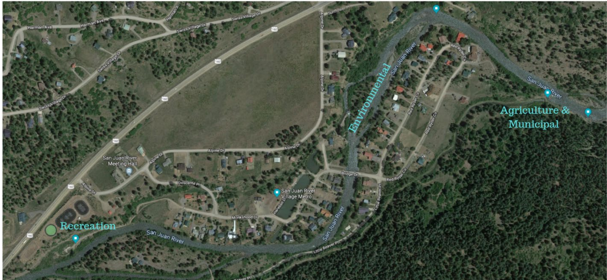
Figure 1: Proposed project area of Concept Design Plan.

The map below illustrates the potential scope of the proposed Concept Design Plan project site. However, final project locations will be determined by property owners, public stakeholders, and the Upper San Juan Watershed Enhancement Partnership.