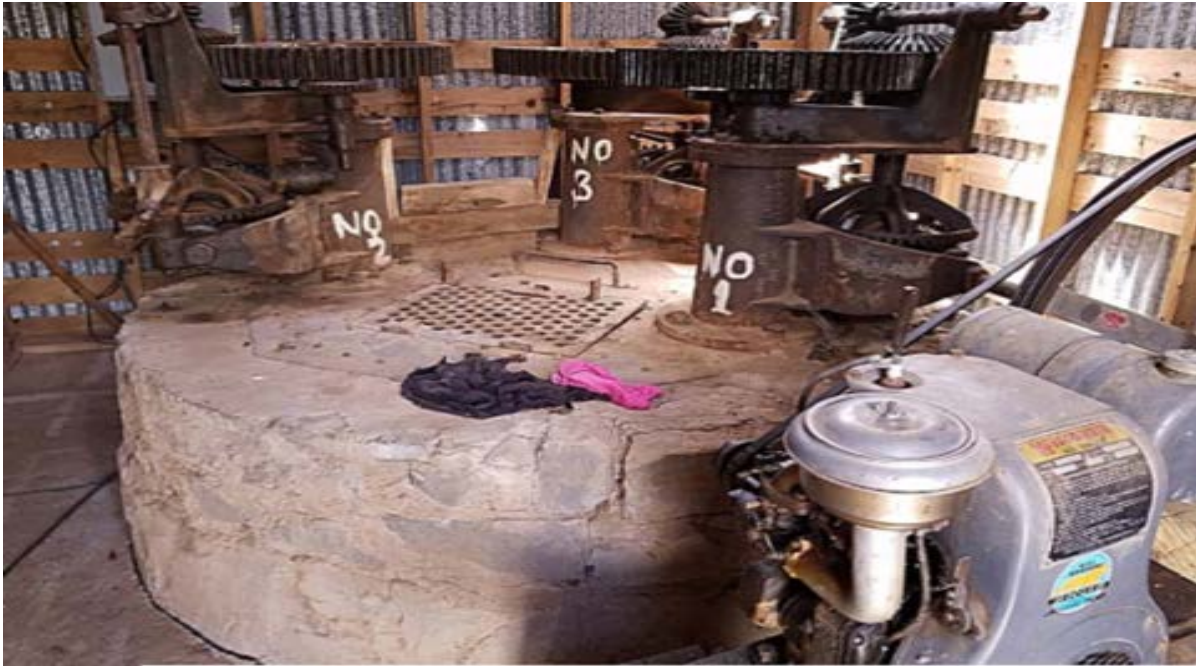
Old Gate Valve Operators

610 Main Street, Blanca, CO 81123 (719)379-3467