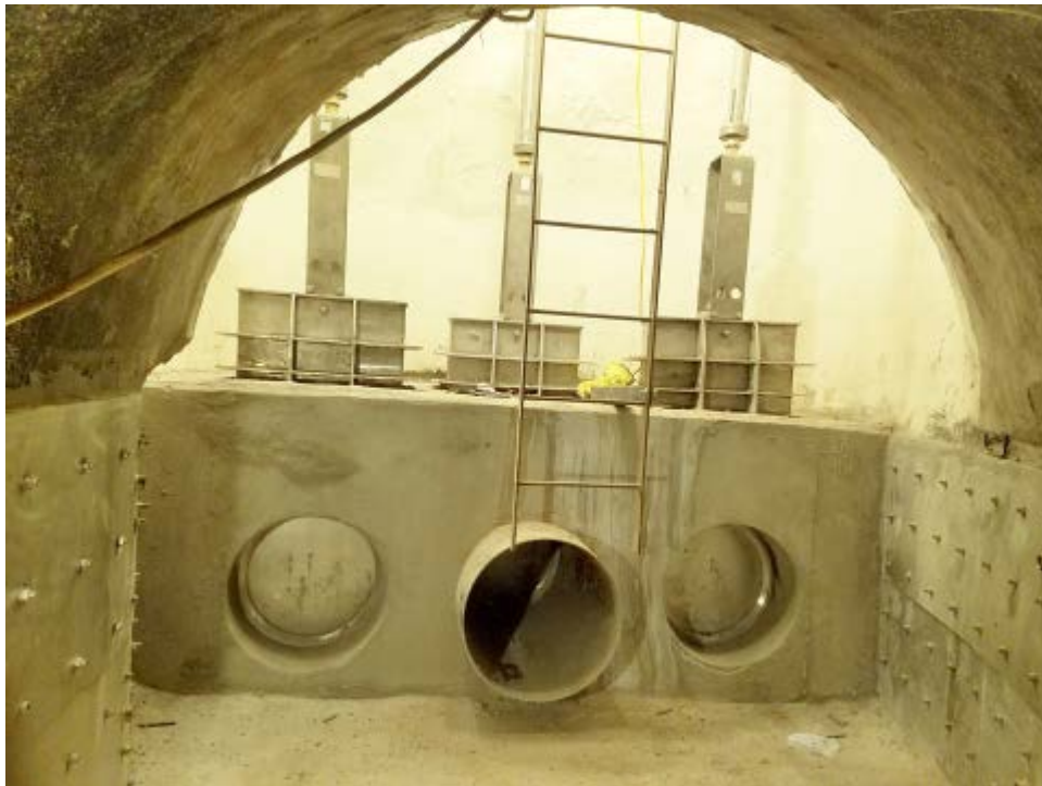
New Gate Valves and stainless steel side panels