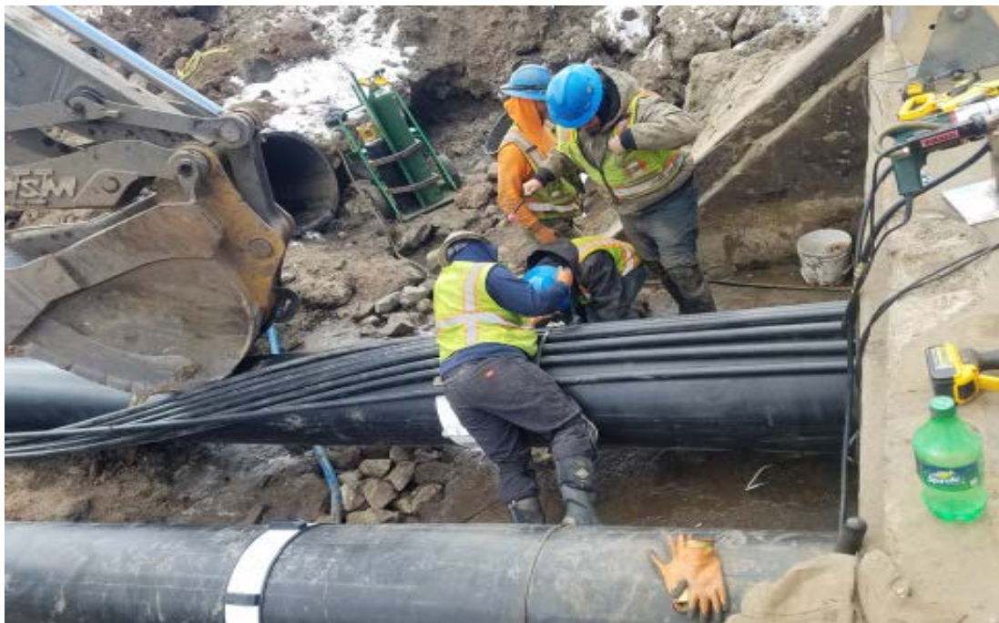
Installing the Liners and Grout Tubes into the Conduits