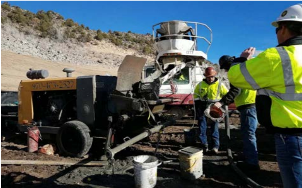
Testing the Grout before pumping through the Grout Tubes to fill the void between the Liner and Conduit

610 Main Street, Blanca, CO 81123 (719)379-3467