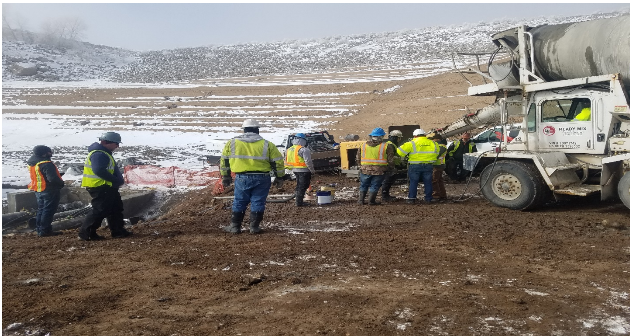
Pumping the Grout into the Grout Tubes