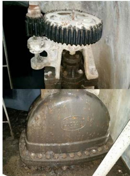
Old Gate Valves