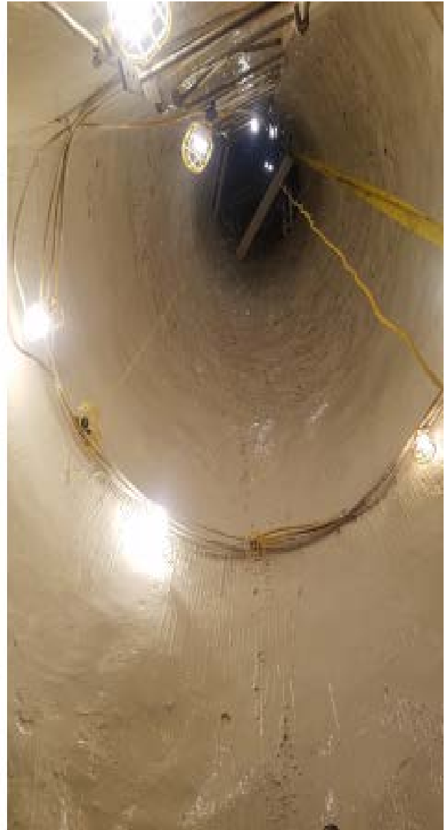
Shaft from Gate Valves to top of Dam, Valve Operators