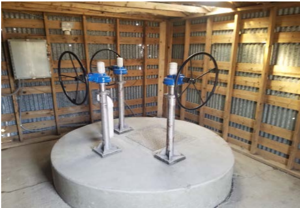
New Gate Valve Operators