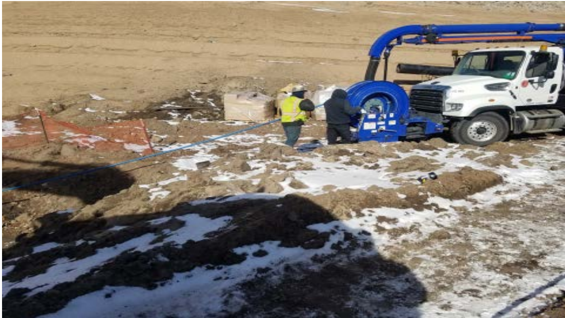
Jetting the Conduit pipes before Lining

610 Main Street, Blanca, CO 81123 (719)379-3467