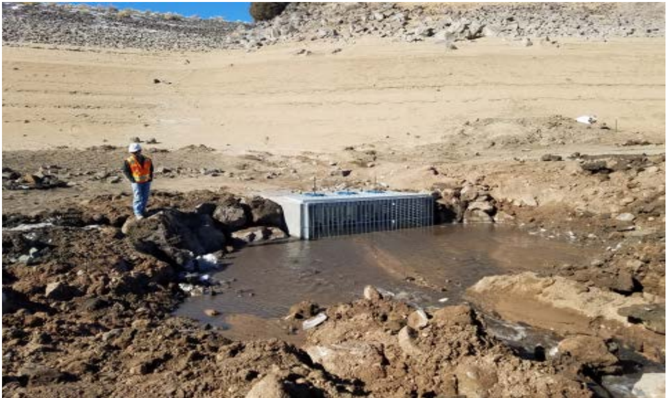
Reconstructed Outlet Structure with new Trash Rack and Gate Valves