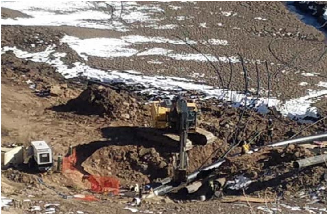
Fusing the sections of Liners and Grout Lines

610 Main Street, Blanca, CO 81123 (719)379-3467