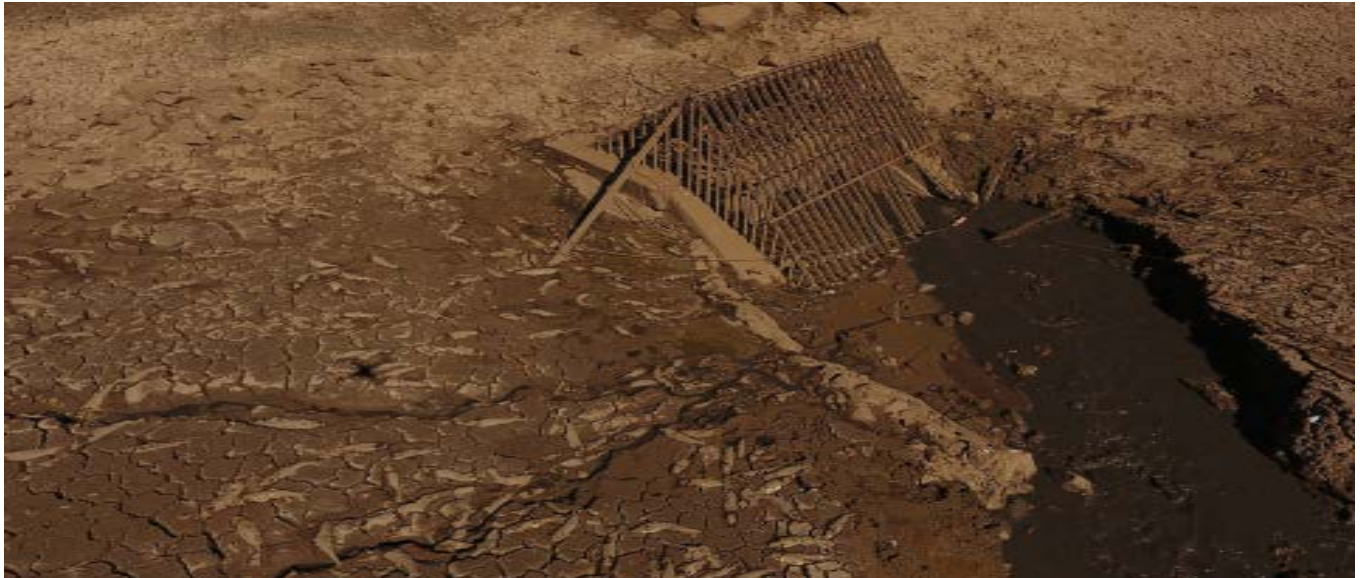
Original upstream Outlet Structure and Trash Rack without Upstream Valve Gates

610 Main Street, Blanca, CO 81123 (719)379-3467