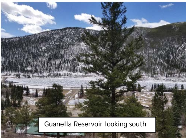
Guanella Reservoir looking south