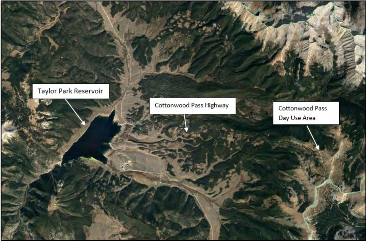
FIGURE 1. MAP OF THE TAYLOR RESERVOIR AREA AND COTTONWOOD PASS HIGHWAY