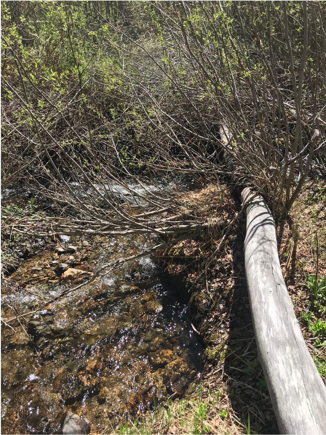
Figure 3: Location of the Flume on Mt. Elbert