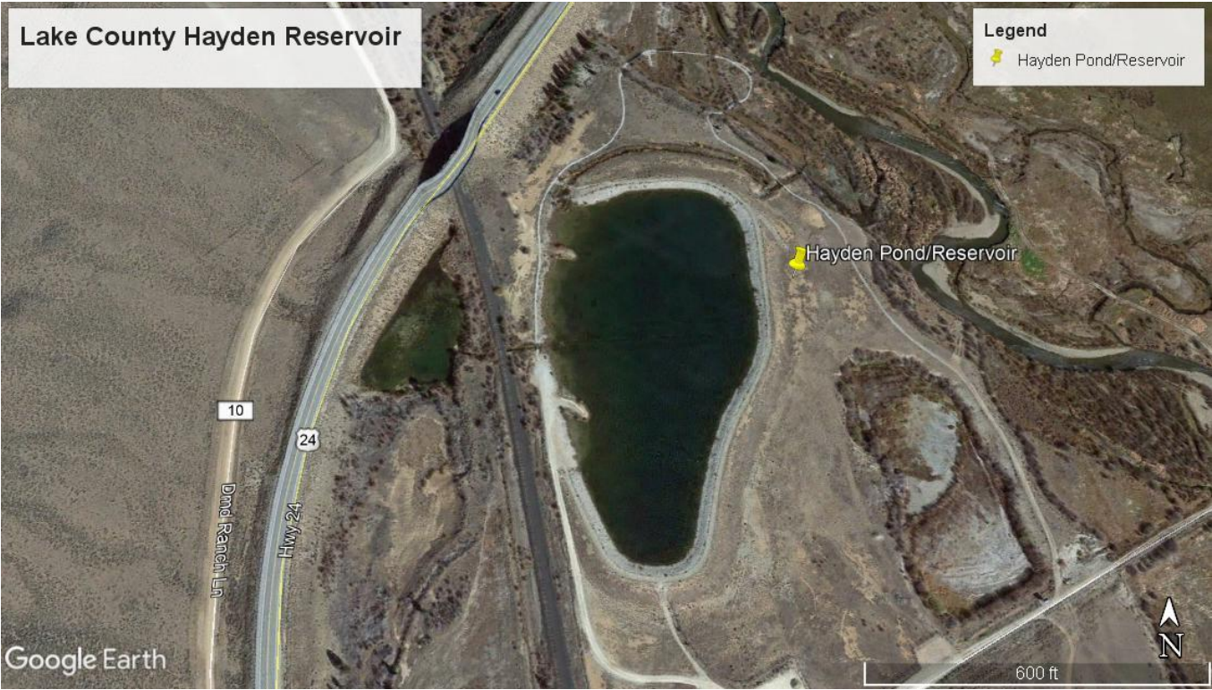
Figure 2: Location of the Hayden Reservoir through Google Earth