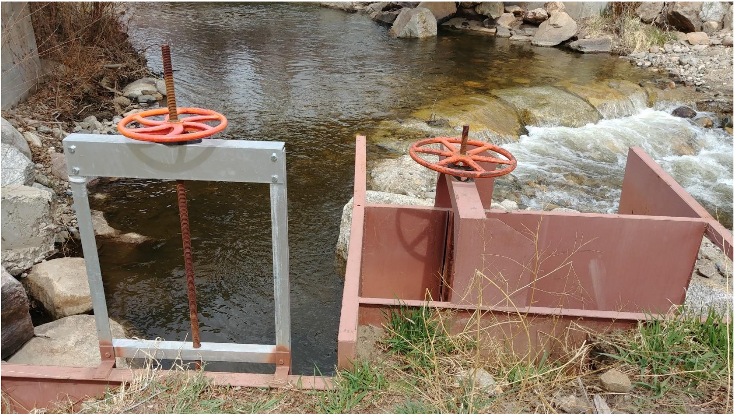
Picture of Diversion Example for Derry 3