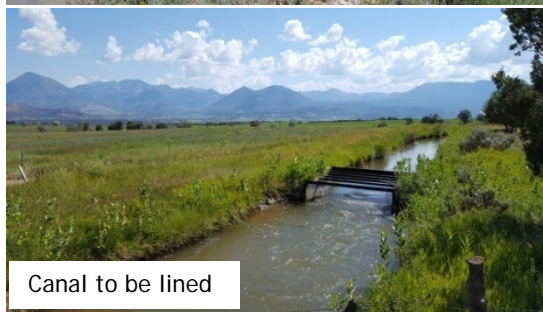
Canal to be lined