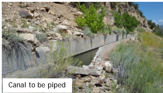
Canal to be piped

CWCB funding will be used to pipe the Gould Canal from Gould Reservoir through the two tunnels, a distance of approximately 2.1 miles and line the earthen canal for approximately 10.3 miles.