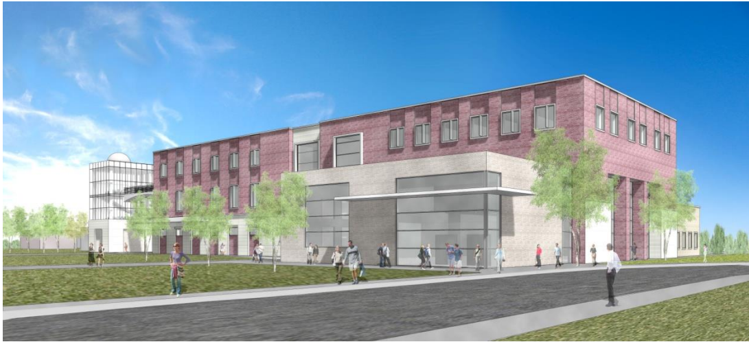
Figure 1. Depiction of new building. The Math and Science Center will be on the right side of the building with the large glass windows and a main entrance facing 7 th street. The MSC will be nested within the larger and new engineering building for Colorado Mesa University.