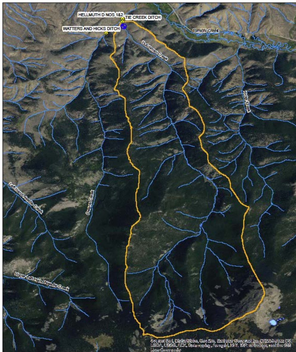
Dutchman Creek Preliminary Instream Flow Proposal Saguache County, Colorado

Map prepared for HCCA- Dutchman Creek ISF Proposal