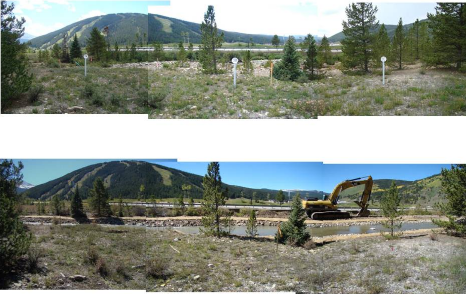
Figure 3: Tenmile Creek; Pool 5 before construction (above) and after construction (below). This picture is before seeding and shrub planting planned for spring of 2014.

Tenmile Creek restoration project Phase 1 accomplishments (submitted to CWCB as supporting material for 2014 WSRA grant application)