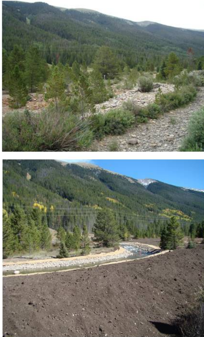
Figure 5: Tenmile Creek; Pool 5 as seen from State Highway 91 before construction (above) and after construction (below). This picture is before seeding and shrub planting planned for spring of 2014.

Tenmile Creek restoration project Phase 1 accomplishments (submitted to CWCB as supporting material for 2014 WSRA grant application)