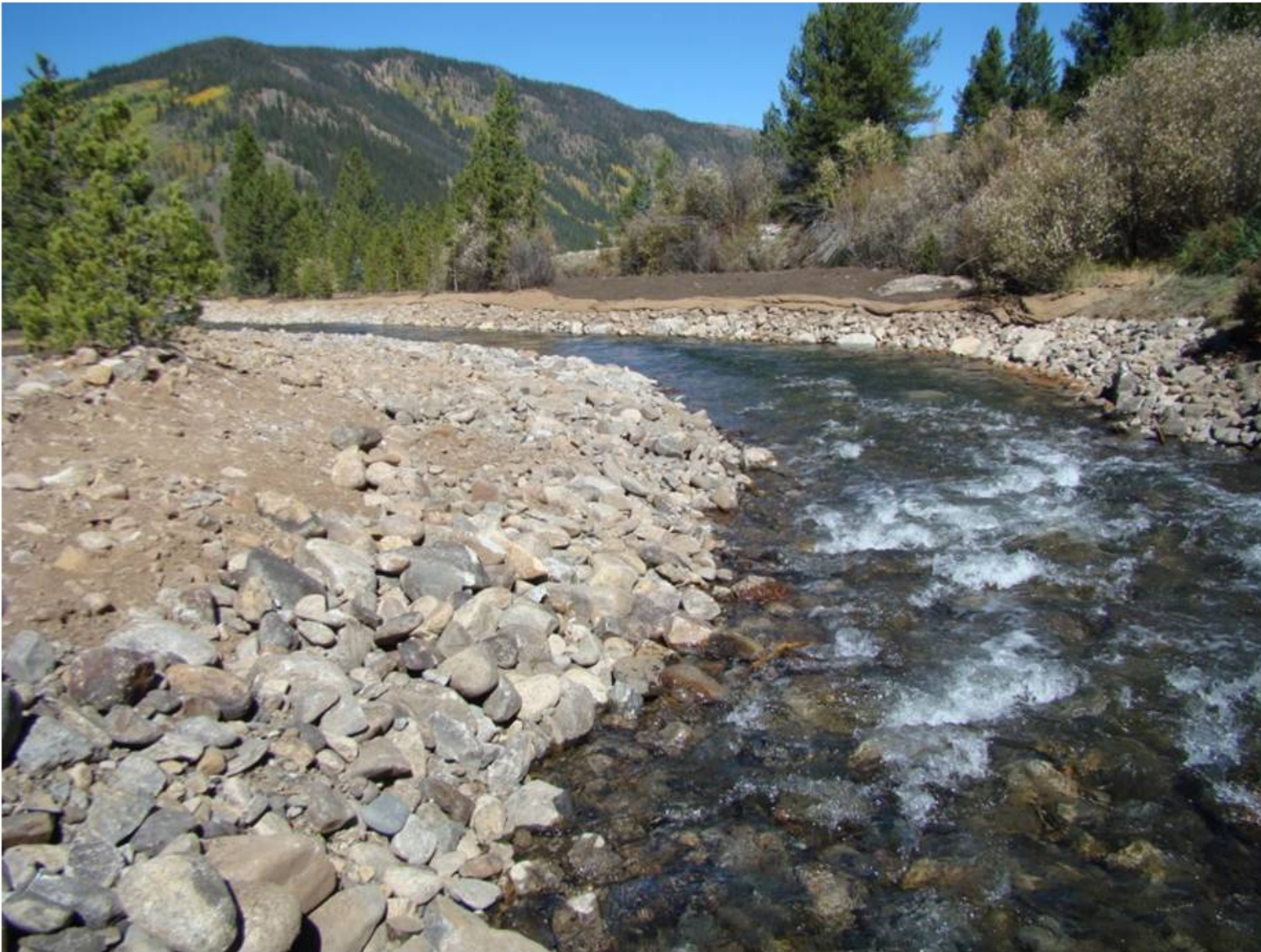
Figure 7: Tenmile Creek; Riffle 8 and pool 8 after construction. This picture is before seeding and shrub planting planned for spring of 2014.