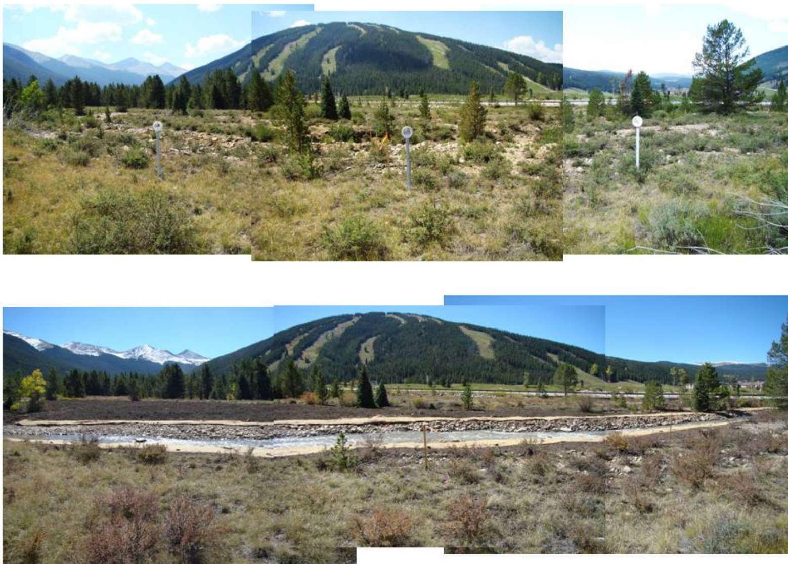
Figure 2: Tenmile Creek; Riffle 5 before construction (above) and after construction. Note soil amendment on far side of Tenmile Creek. This picture is before seeding and shrub planting planned for spring of 2014.

Tenmile Creek restoration project Phase 1 accomplishments (submitted to CWCB as supporting material for 2014 WSRA grant application)