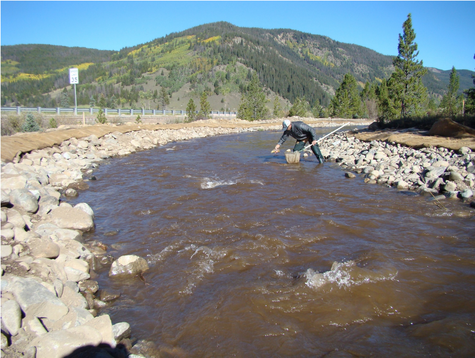
Figure 8: Tenmile Creek; Fisheries technician releasing a trout rescued from the old channel shortly after turning water into the new channel. Note that the turbidity in the water is the temporary result of turning water in to the new channel. Pictured location is pool 5. This picture is before seeding and shrub planting planned for spring of 2014.