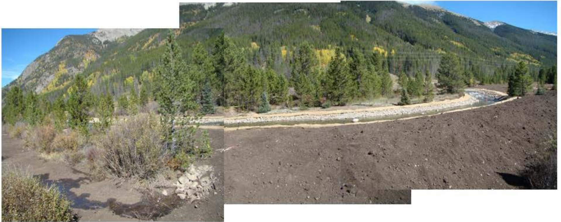
Figure 6: Tenmile Creek; Pool 5 panorama showing soil amendment and oxbow connection. Note a small amount of water flowing into oxbow feature at bottom left. This picture is before seeding and shrub planting planned for spring of 2014.

Tenmile Creek restoration project Phase 1 accomplishments (submitted to CWCBC as supporting material for 2014 WSRA grant application)