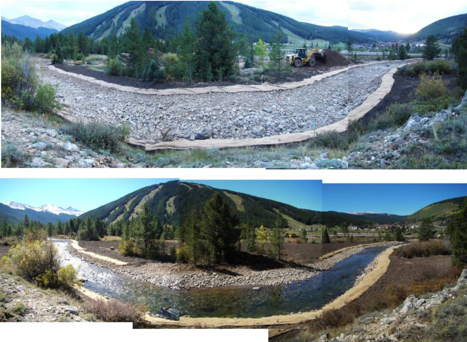
Figure 4: Tenmile Creek; Pool 6 during construction (above) and after water was turned in to the new channel (below). This picture is before seeding and shrub planting planned for spring of 2014.

Tenmile Creek restoration project Phase 1 accomplishments (submitted to CWCB as supporting material for 2014 WSRA grant application)