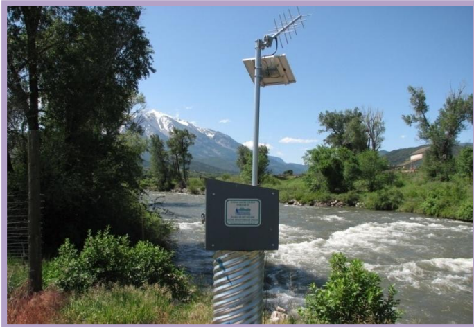
Crystal River DWR/CWCB Satellite Gage

increase reliability and real time data transmission rates, will require the DWR to continue to upgrade the system in the future. The costs associated with the continued refurbishment and operational viability of the system is approximately $300,000 per year.