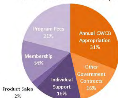
CFWE FY2013 Revenue by Source