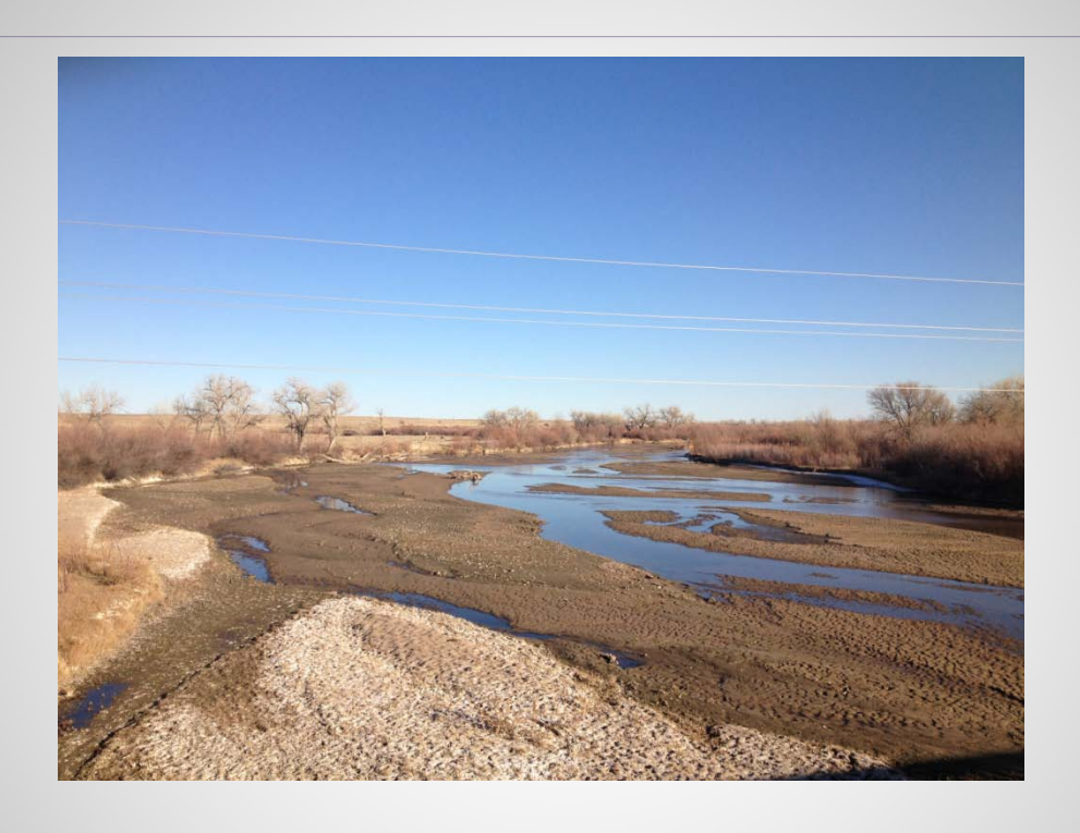
2012 Drought Impacts Survey available now!!!