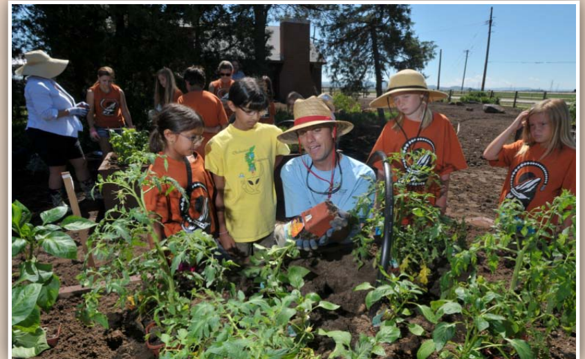
Demonstration Site w/ Botanic Gardens