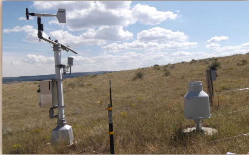
Monitoring Natural Conditions