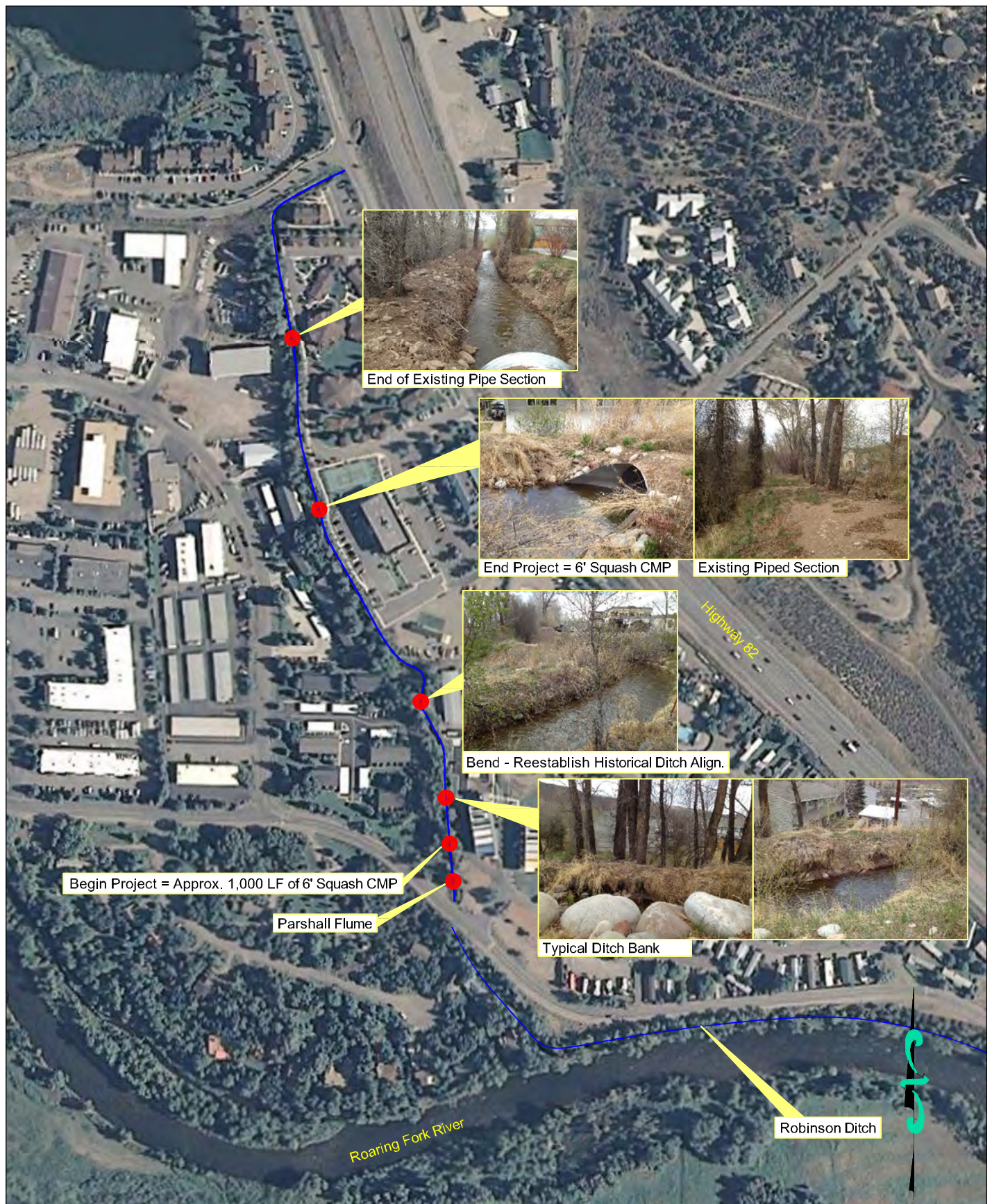
Figure 1: Proposed Work Location Map 2009 NAIP Aerial Photography