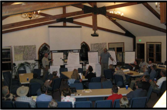
Large format maps displayed at public meetings.

We also created a 4-page newspaper insert that was modified for display at the RFC office, in public buildings, and at the public meetings. The insert was reprinted and available at the public meetings.