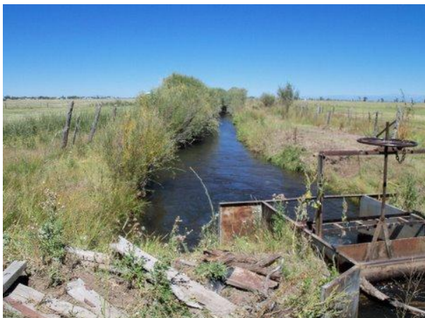
One of the Laterals in the system.

Water is delivered by time according to the share, but if one ditch is narrow and the other is wide, there is no way to quantify or regulate water use.