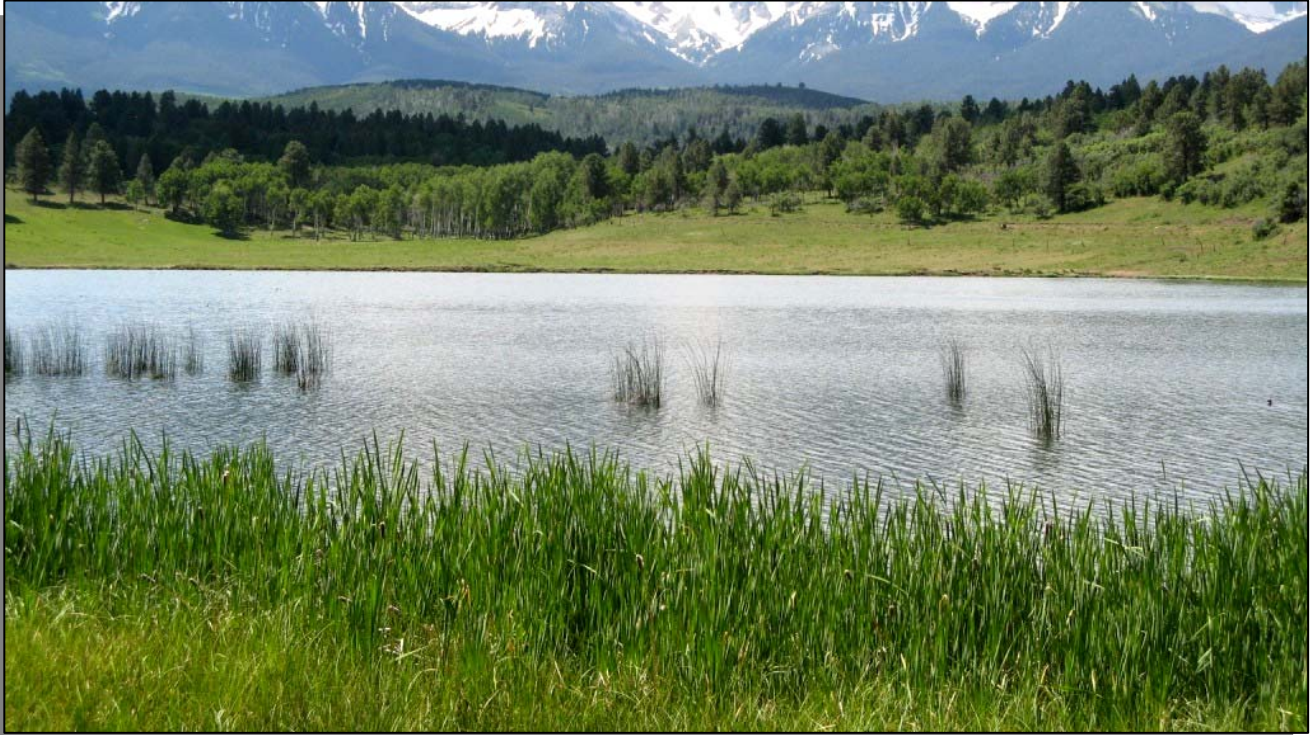
Close up of Lake Otonawanda looking south (from north shore)