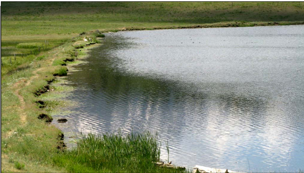
Dam on east side of Lake