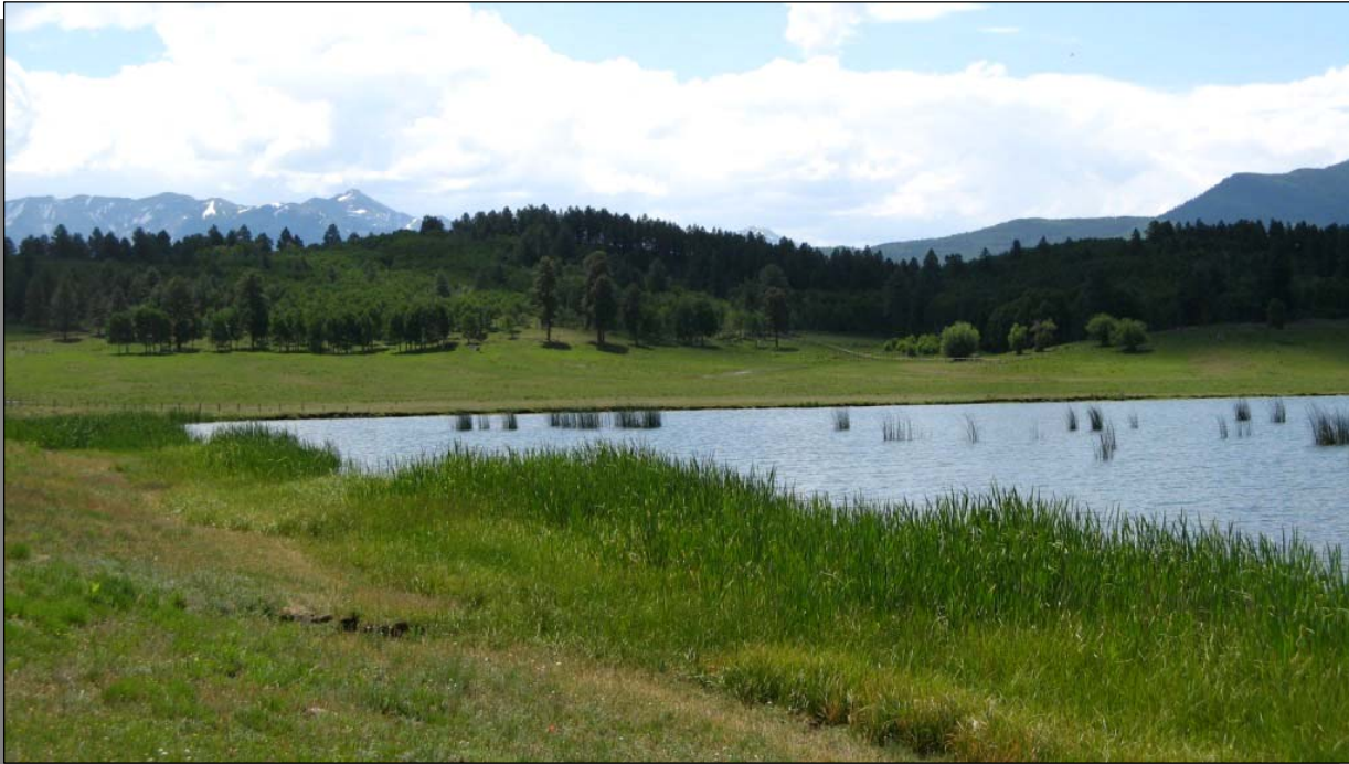
Lake Otonawanda on southwest side, looking east