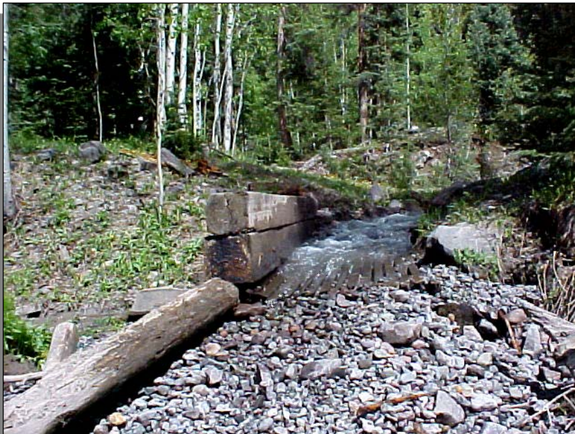
Beaver Creek Diversion with “grizzly” ... this the alluvium fills this headgate frequently during high runoff and storm events, requiring regular maintenance and considerable travel